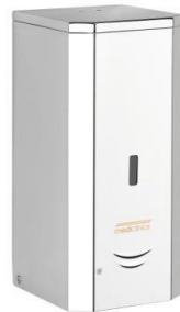
DJ0037AC/DJF0038AC/ DJS0039AC Bright finish