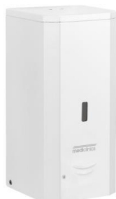
DJ0037A/DJF0038A/ DJS0039A White epoxy finish