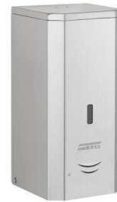
DJ0037ACS/DJF0038ACS/ DJS0039ACS Satin finish