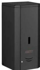
DJ0037AB/DJF0038AB/ DJS0039AB Matte black epoxy finish